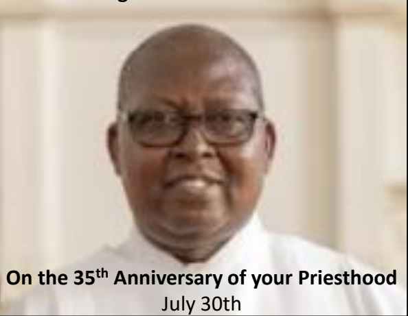
On the 35 th Anniversary of your Priesthood July 30th