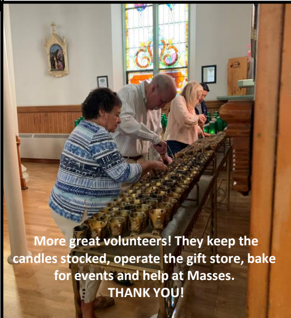
More great volunteers! They keep the candles stocked, operate the gift store, bake for events and help at Masses.

We welcome residents, seasonal employees and all visitors to Mackinac Island. By worshipping in our parish, you join a Roman Catholic tradition dating back 2,000 years and a 350-year-old faithful Island community. By joining us, you are no longer a stranger here.